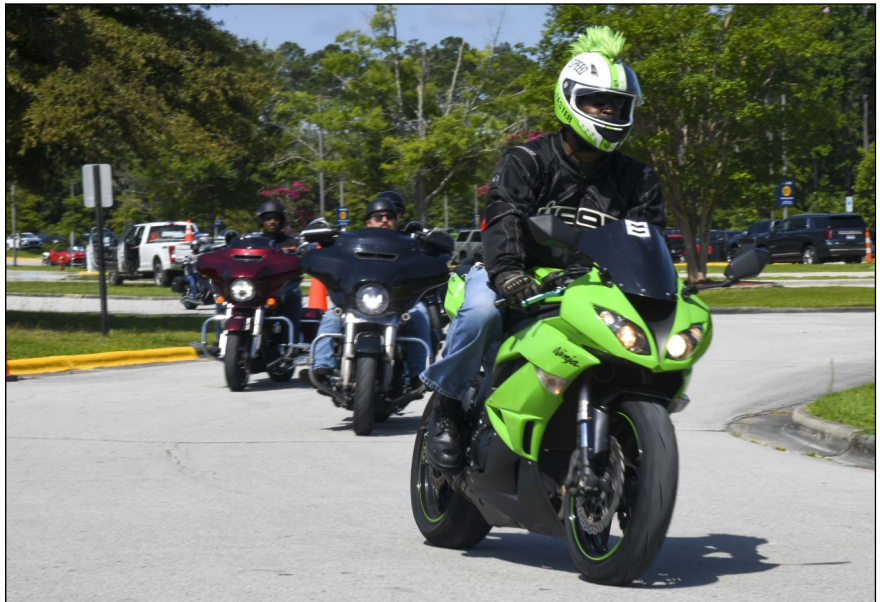
Members of Naval Medical Center Camp Lejeune's Motorcycle Mentorship Program participated in a command-sponsored ride July 16, 2021.

June 21, 5:50 a.m., 23-year-old E-4 Location: Yokohama, Japan Remarks: Rider laid the bike down to avoid a collision with a PMV-4. Rider was transported to local hospital and treated for road rash.